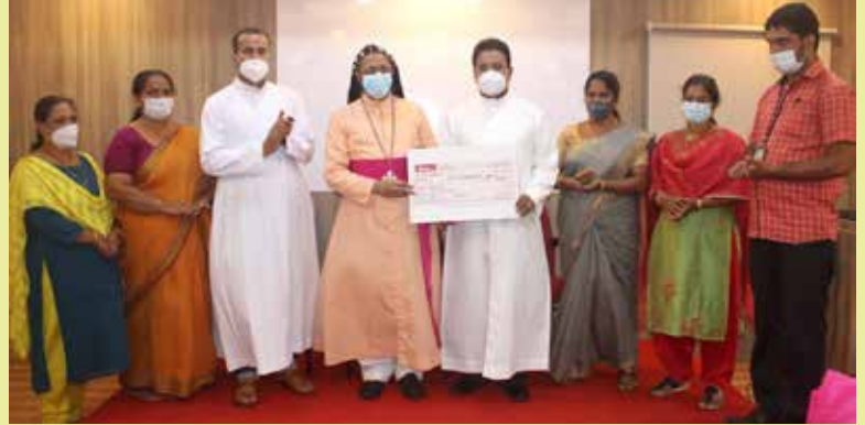
Kaduthuruthy and Uzhavoor foranes of the Archdiocese.